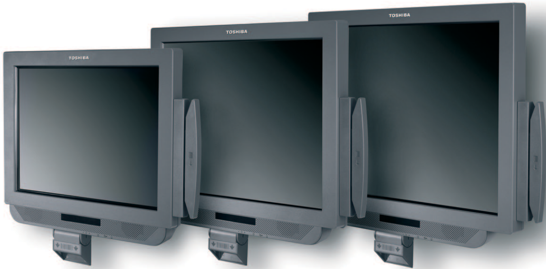
Toshiba AnyPlace Kiosk 15-inch, 17-inch and 19-inch models with dual core AMD processors; 15-inch entry-level model also available

AnyPlace Kiosk self-service solutions are easy to install and can be customized to fit almost any environment. The sleek flat panel touch screen—now available in 15-inch, 17-inch and 19-inch sizes for the performance units—incorporates high-performance Mobile AMD Turion dual-core processors that support leading-edge applications. AMD Turion is an advanced dual-core processor uniquely optimized for multitasking and rich media applications. The entry-level models incorporate the Via C7 processor for reliable performance and low power consumption. Dual video display capability delivers an outstanding customer experience for digital signage or second touch screen support, and a magnetic strip reader and scanner option fit seamlessly into this powerful yet low-profile device.